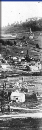
Bolivar circa 1881