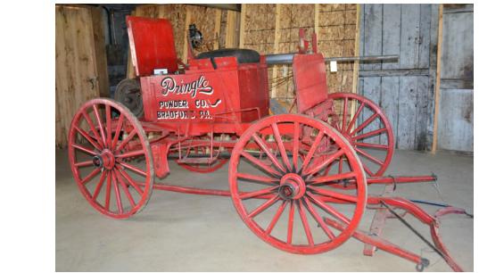
This 100 year old "shooter's wagon" hauled dynamite & nitroglycerin when it was time to shoot a well.