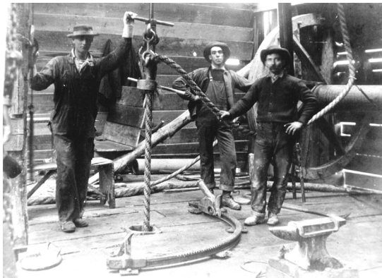
Roughnecks working on a local oil well.

Bolivar gas globe from the Allegheny Refiners.